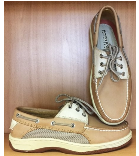
Kindergarten– 8th Grade: Sperry Boat-Style Shoe Light Brown w/ light soles Must have tied laces