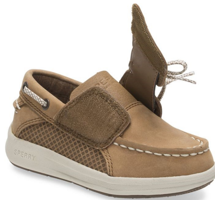
Kindergarten: Sperry Boat-Style Shoe Light Brown w/ light soles Hook & Loop Closure or tied laces

PreK3 & PreK4: Students must wear strapped sneakers. No laces, no high tops. Kinder – 8th Grade: Students must wear Sperry style boat shoes; does not need to be Sperry brand. Must be light brown with light colored soles. See images below.